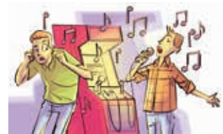
My friend is the worst singer in the world.

I think The Avengers is worse than Spider-Man 4 .