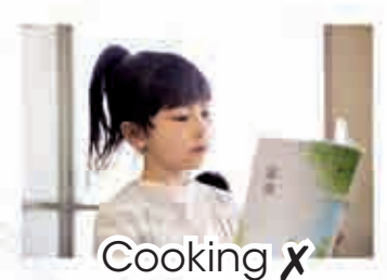
2. Does she like cooking?