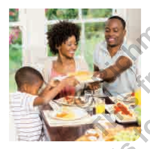
2. _____ the afternoon 4.