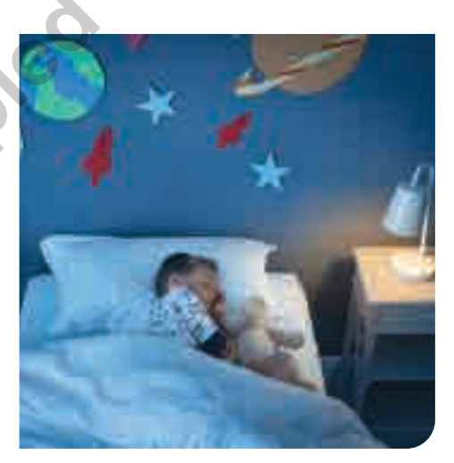
6. _____ night